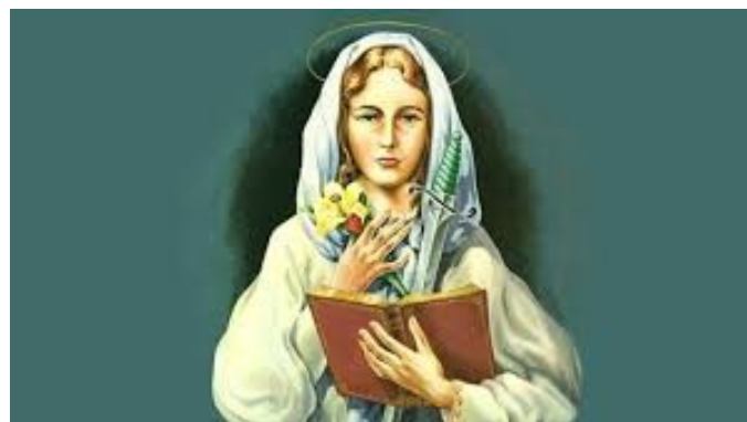
St Dymphna- patron saint mental health

“Give instruction to a wise man and he will be still wiser, teach a righteous man and he will increase his learning.” Proverbs 9:9