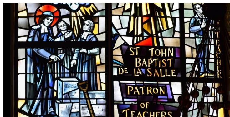
St. John Baptist de La Salle

“Give instruction to a wise man and he will be still wiser, teach a righteous man and he will increase his learning.”