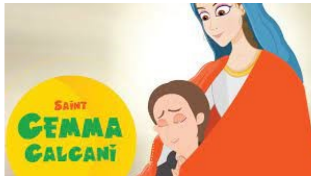
St Gemma Galgani- patron saint of students

"Give instruction to a wise man and he will be still wiser, teach a righteous man and he will increase his learning."