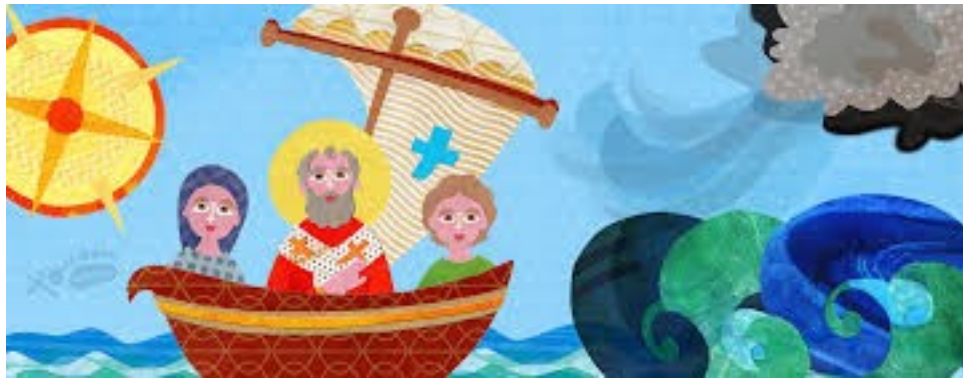
St Nicholas of Myra-patron saint of children

“Give instruction to a wise man and he will be still wiser, teach a righteous man and he will increase his learning.” Proverbs 9:9